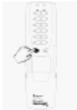
Fig 8c. On the Secondary Controller, Press and Hold the INCLUDE button. Then Release when LEDs flash.