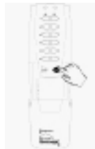
Fig 6b. Press and hold the DELETE button.