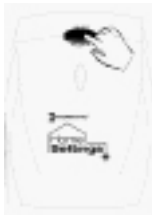
Fig 5b. Press and release the programming button