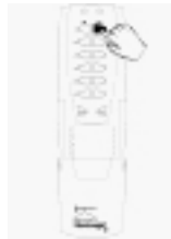
Fig 8d. On the Secondary Controller, Press and release the Channel 1 OFF/DIM button.