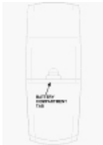
Fig 2a. Battery compartment door