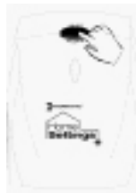
Fig 6c. Press and release the Programming Button.