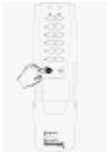
Fig 4b. Press and hold the INCLUDE button