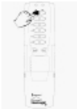
Fig 8b. On the Primary Controller, Press and release the Channel 1 ON/DIM button.