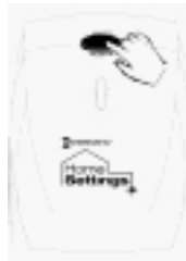
Fig 3c. Press and release the programming button.