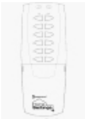
Fig 1. HA09 Handy Remote Controller