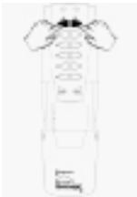
Fig 4a. Press and hold the Channel ON and OFF buttons