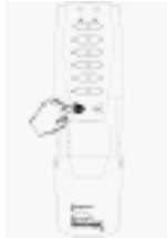
Fig 3b. Press and release the INCLUDE button