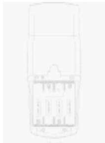
Fig 2b. Battery compartment.