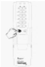
Fig 8a. On the Primary Controller, Press and Hold the INCLUDE button. Then ton.