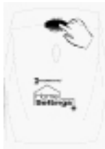
Fig 4c. Press and release the programming button