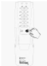
Fig 5a. Press and release the DELETE button

(See Fig 5a and 5b) Follow the same procedure as Creating a Network except press the DELETE button instead of the INCLUDE button.