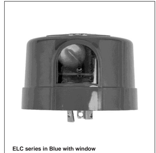
ELC series in Blue with window