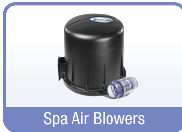
Spa Air Blowers