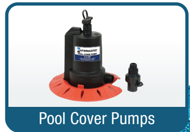
Pool Cover Pumps