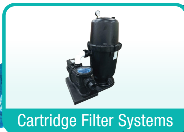
Cartridge Filter Systems