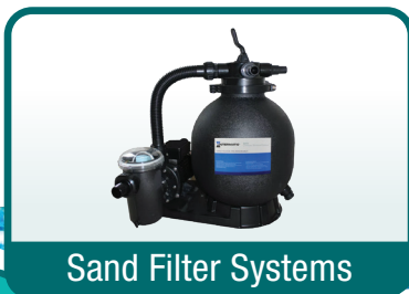
Sand Filter Systems